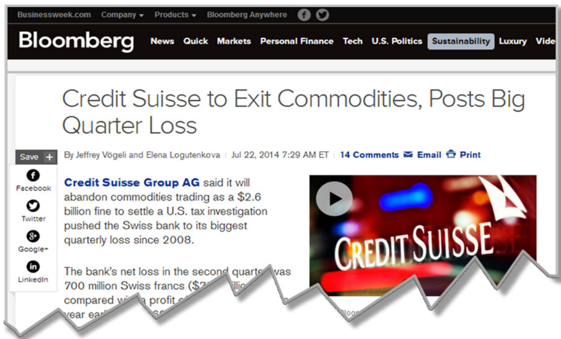
Figure 1: Source - Bloomberg News article clipping 2

Headline after headline confirm the ongoing saga: